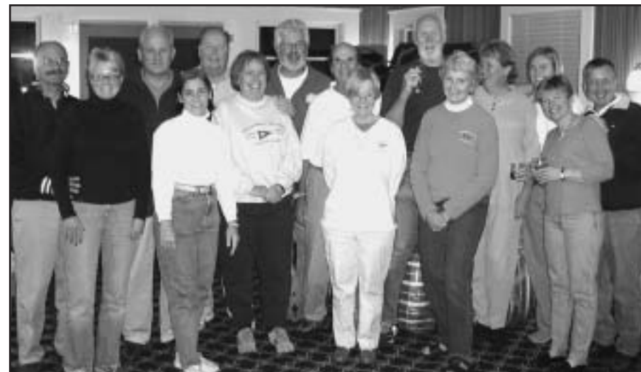
FALL 2005 WORK WEEKEND